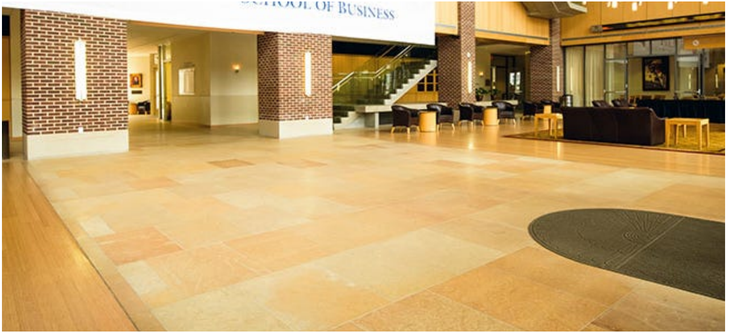
SMU Cox School of Business' Executive MBA building.